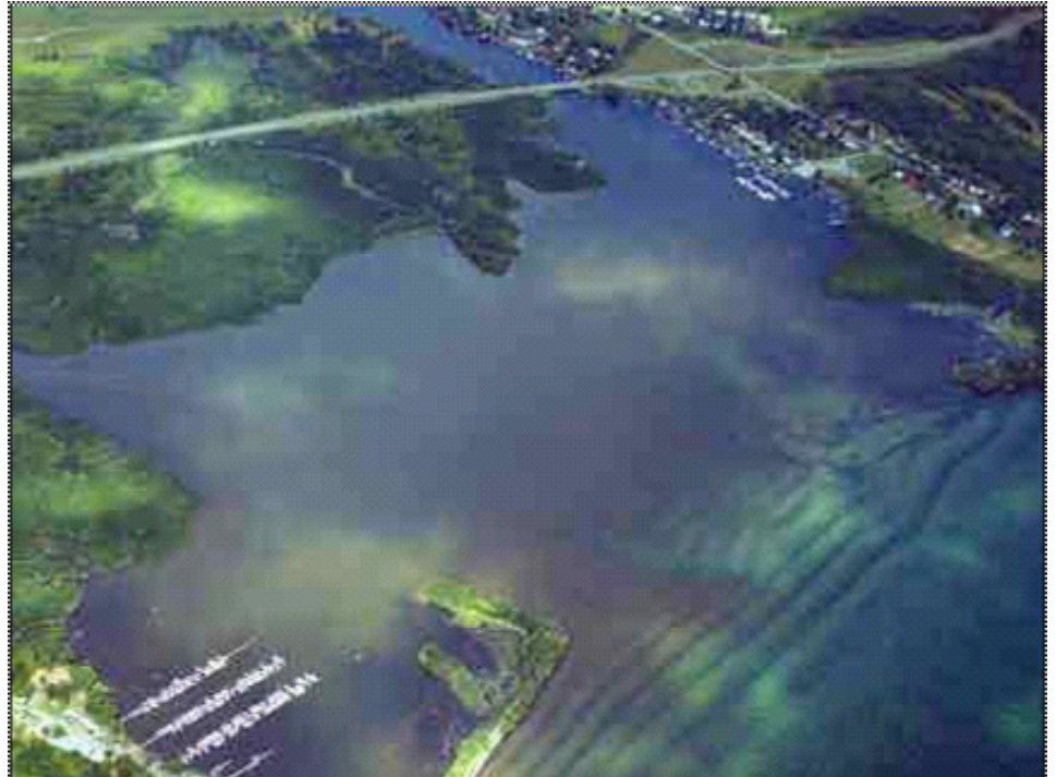
Braddock Bay, Lake Ontario

The Braddock Bay watershed contains a mix of residential development, state park, and protected wildlife areas.