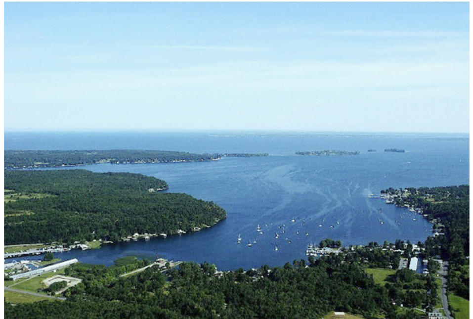
Henderson Harbor. Jefferson County, New York