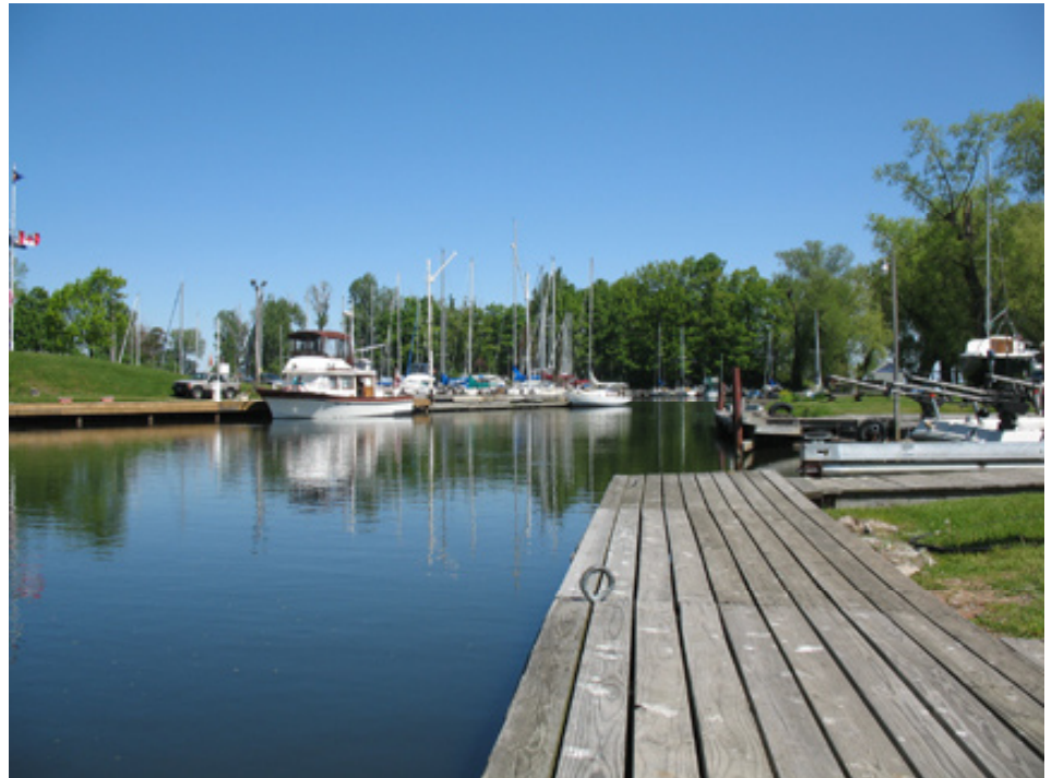
Pultneyville Harbor, New York

In comparison to concentrations in other Lake Ontario rivers, bays, and offshore waters, total phosphorus concentrations were significantly higher.