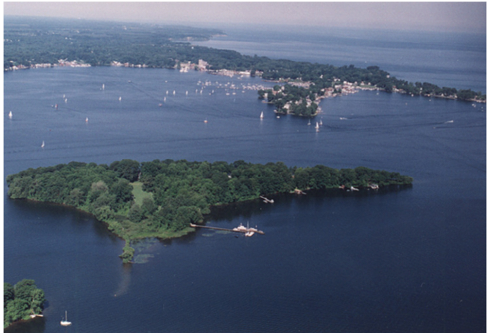
Sodus Bay, New York

Sodus Bay has nuisance algae and macrophytes which can cause beach closings.